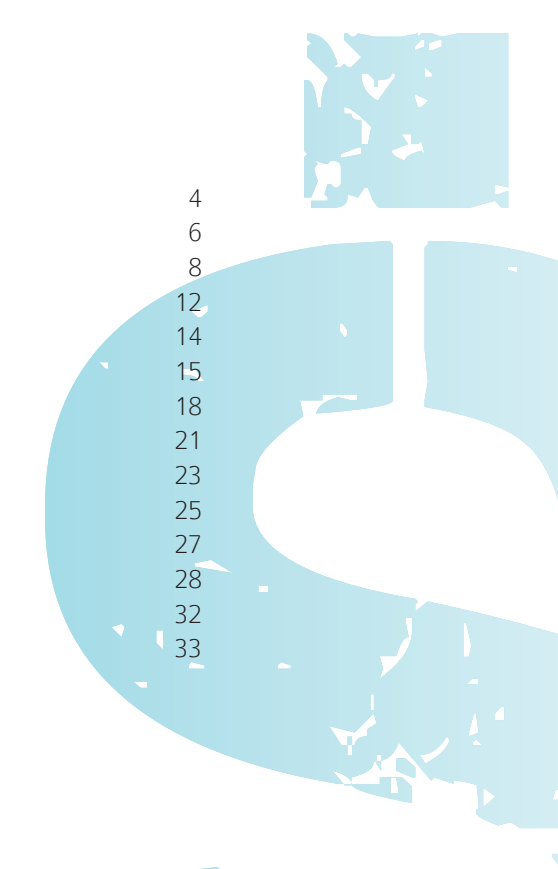
Table 1. ArcelorMittal annual contribution to the CSDF as at December 2011 (US$)12Table 2. Allocations, approvals, and disbursements from the CSDF in US$ (2006 – 2010)13Table 3. Projects funded and implemented as at April 2010 (all amounts in US Dollars)16Table 4. Total disbursements to counties as at August 201118Table 5. Summary of estimated social contribution for the top mining companies26Table 6. Proposed changes to the composition of the DFC, mandate and leadership28Table 7. Proposed changes to the composition of the CDMC, mandate and leadership29