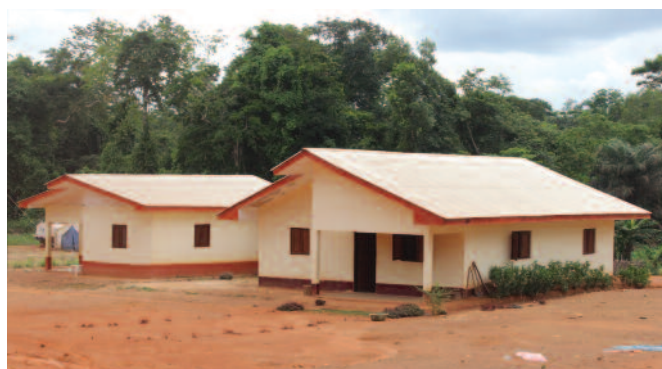
These concrete structures were built by Putu for community members resettled from the airstrip facility in Grand Gedeh County.

Putu is still in the pre-operational stages of its agreement. It has opened channels of communication with community members and has largely lived up to the mandates of its MDA. If Putu can maintain a relationship with the affected communities in Putu District while also working with the county government to better oversee the use of its funds, it may be able to avoid some of the routine problems in China Union and ArcelorMittal concession areas. 108 In this respect, China Union and ArcelorMittal could take steps to learn from Putu.