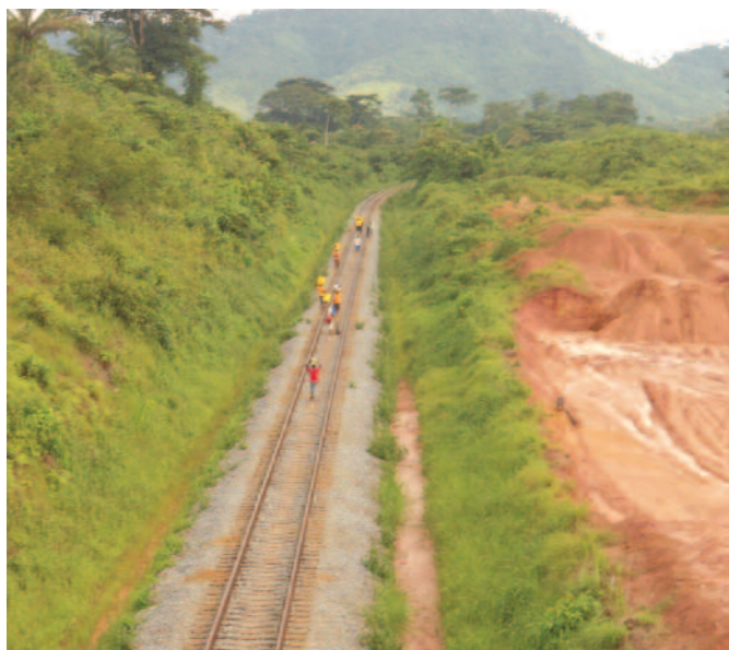
People walking along the railroad used by ArcelorMittal, Nimba County.

This case study examines ArcelorMittal's tax payments to illustrate a key finding of this research: Liberia gives generous tax concessions in the iron ore sector that undercut the Liberian Revenue Code. Also, because the government seems unable to track what extractive industries should pay in taxes, it is possible that the revenue it receives is considerably less than the actual amounts owed. In order for a development model based on attracting FDI and exporting raw materials to create impactful economic growth, the government must implement a comprehensive strategy that seeks to extract maximum taxes and other benefits from the iron ore mining sector. This case study focuses on ArcelorMittal because it has shipped the most ore and there is more data regarding its operations, i.e. production and export.