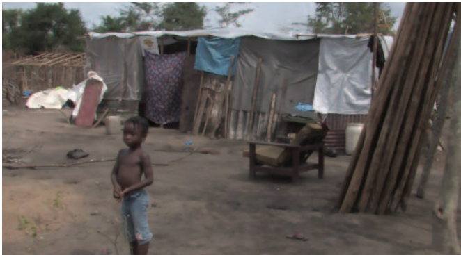
Children of former BMC workers, evicted from their homes in early 2014, Bong Mines, Bong County, February 2014).

This case study examines community relations with China Union since it commenced operations. It supports another key finding of our research: while host communities look forward to development benefits brought about by iron ore mining concessions, relations between them and mining companies have generally become worse. There is a troubling trend whereby relationships between communities and concession companies deteriorates as the mining sites become fully operational. Residents of project affected and host communities have iterated that they have received very few developmental benefits from mining.