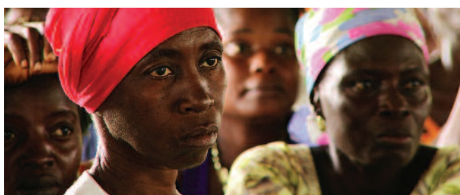
Residents of Bong Mines discuss China Union operation. May 2014.

Around the same time a citizen advocacy group composed mostly of youths, the Fuamah Progressive Platform (FPP), began engaging issues of community relations in the China Union concession. Comprising of university students and residents from the Bong Mines area, the FPP takes a direct and confrontational stance with China Union in addressing the company's failure to live up to its MDA. 79 The FPP was critical of representatives from the Legislative Caucus, claiming that complaints from legislators were largely self-serving and were not aimed at addressing community grievances. 80 SDI observed a large FPP organized protest in Bong Mines in February 2014, where FPP drew a crowd of at least 200 people.