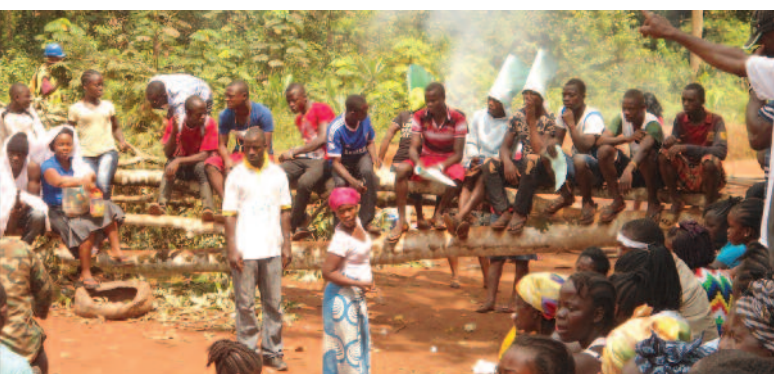
Tokedah protesters including girls at the road block.

The Liberian government continues to maintain that these protests were violent and has not acknowledged that the paramilitary units were heavy handed in their response, despite several witnesses corroborating reports of their actions. Additionally, the Government of Liberia refuses to engage with grievances put forth by these communities in any meaningful way. 146 Even though crop compensation meetings have resumed, the atmosphere surrounding the ArcelorMittal concession as of August 2014 was defined by terror, fear, a lack of meaningful dialogue between stakeholders, and general uncertainty. 147 Many of these same conditions led to the Liberian civil war.