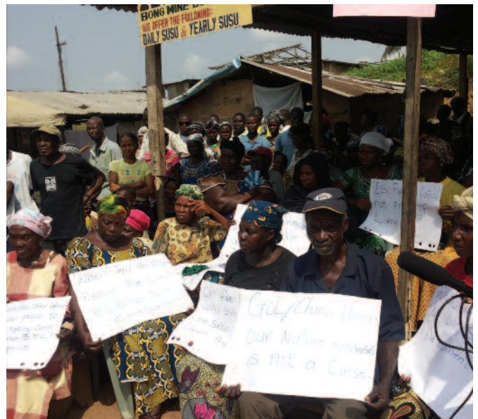
Demonstrators at an FPP-organized protest in downtown Bong Mines, Bong County, February 2014.

Expand employment opportunities and cease the practice of hiring contract workers as permanent substitutes for employees. This will further strengthen your relationship with Liberian workers who currently feel that they are being exploited.