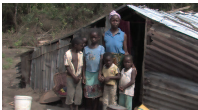
Families forced to resettle after the former Bong Mines workers were evicted from their homes by the GoL, Bong Mines, Bong County, February 2014.

Resettlement will become a larger issue as China Union rehabilitates the railroad and expands operations. Former BMC workers in Fuamah District, who had to be relocated due to the MDA provision that China Union renovate old company houses for its current employees, were evicted with a single payment of $500. Due to the inadequacy of this payment some of these workers along with their families live in squalid conditions with no access to clean drinking water and in makeshift houses. These houses do not provide adequate shelter for many elderly former Bong Mines workers and their dependents. 75 This situation has been a source of tension between China Union and the community.