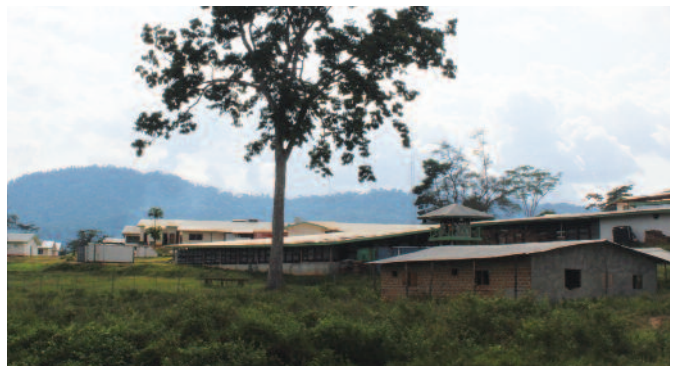
Putu Mountain, where Putu's mining operations will commence during the dry season, Tiamah Town, Grand Gedeh County.

The government should understand that Liberia's most prized resource that is being overlooked is its population. Ultimately the development of capital goods and industries lifts nations out of poverty; but it is citizens' engagement in every aspect of the economic, political and social life that sustains and propels a nation to economic prosperity. A nation that does not invest in education and technical knowhow cannot hope to develop the skills necessary to create self-sustaining engines of growth. Moreover, a country that continuously abuses its citizens and treats them as expendables without regard for the overall wellbeing of the society at large will likely never create the institutions necessary for human capital maximization. If the Liberian government fails to revise and realign its loyalties and priorities, Liberia will remain trapped by the natural resource curse of poor governance and serial exploitation by multi-nationals.