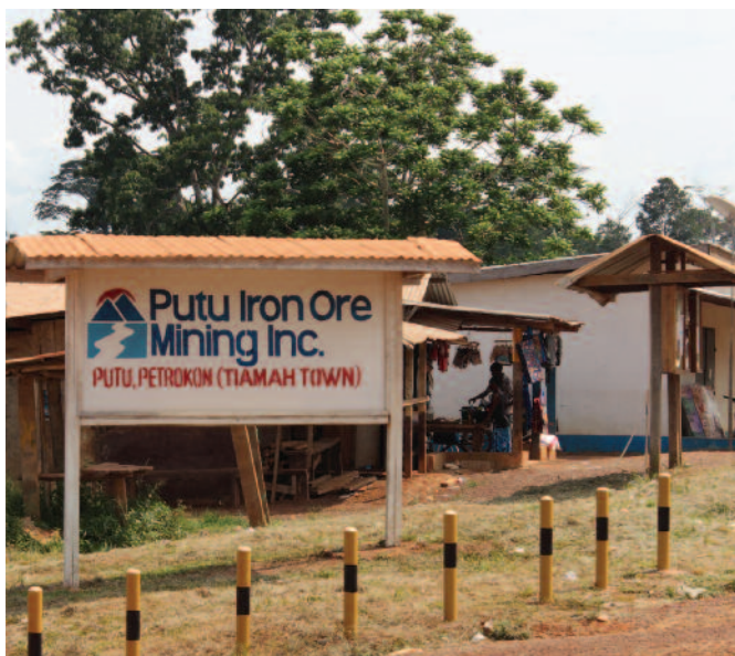
Sign pointing to entrance of Putu Iron Ore Mining, Inc's Headquarters in Tiamah Town, Grand Gedeh County, July 14, 2014.

This case study illustrates that mining companies could do more to improve their relationships with project affected and host communities. The relative calm and peaceful-coexistence that Putu enjoys with its host communities may not be sustainable or it may not be a result of community-wide satisfaction with the companies' operation, but it does suggest that it is possible to have an amicable relationship with communities.