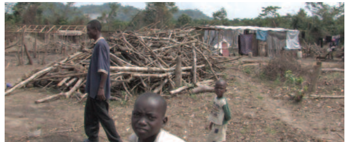
Former BMC workers and their families struggle to construct shelter after being evicted from their homes and given $500 USD to resettle, Bong Mines, Bong County, February 2014.

In February of 2014 China Union sent its first 50,000 tonne shipment of iron ore valued at around $1 million in royalty payments, and it aims to ship 10 million tonnes by 2016. 58 The company is subject to income taxes of 25 percent of its annual corporate profits and a royalty payment on the value of iron ore it ships anywhere from 3.25 percent to 4.5 percent, depending on the market value of iron ore at the time of shipping. 59 China Union is to ship iron ore it mines from Fuamah district along the railway to the Freeport of Monrovia. 60 China Union is required to rehabilitate the Bong Mines railroad and recondition roads in the areas near its mining operations. 61