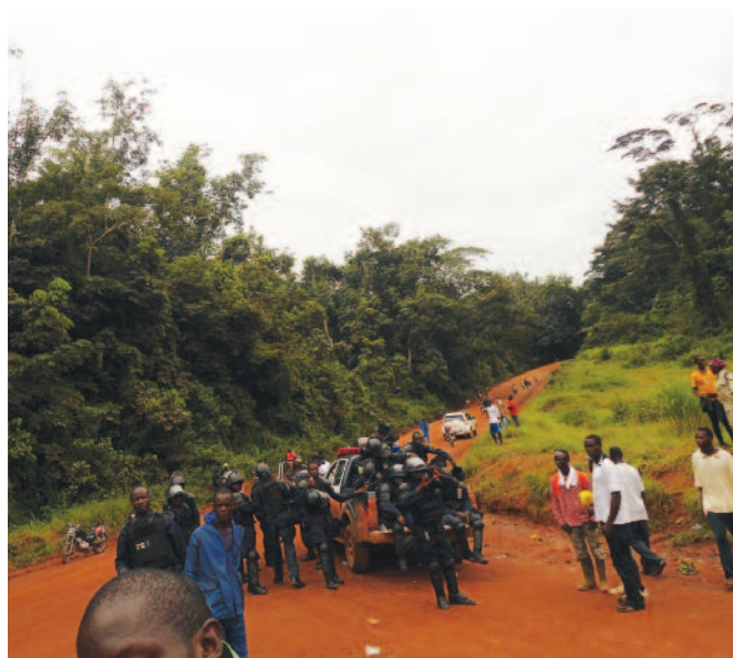
Liberian paramilitary police deployed to demonstration by citizens protesting ArcelorMittal operations, Nimba County.