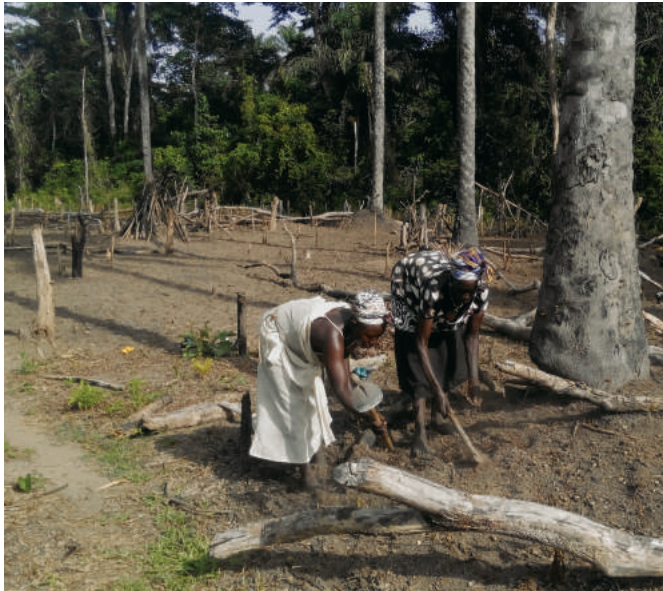
The vast majority of Liberians depend on their customary land for their survival and livelihoods. Women farmers in northern Lofa County.

Access to and ownership of land has been and will continue to be a contentious issue in Liberia with the potential to undermine development and a major source of conflict in the country. There are statutes, policies, and clear procedures on how private lands can be owned and documented. This is not so with communal lands. The current Constitution of Liberia does not explicitly recognize the right to communal land ownership. Despite this backdrop, communities in the rural parts of the country continue to claim ownership to the lands. However, this claim to ownership is based on customs and not substantiated by law.