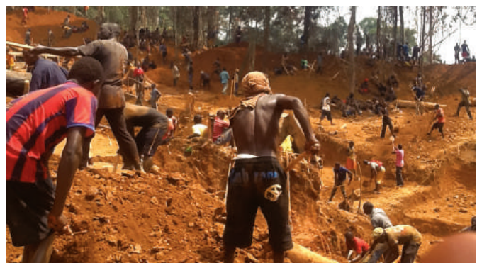
Insecure land tenure leaves communities and their resources vulnerable to a wide range of actors. Illicit miners have invaded Vambo Township in search of gold.

When these internal organizational challenges are addressed, sustainable livelihood of communities that live off the land lies squarely in collective title. It has promises in lifting households out of poverty, it gives communities hope, increases the choices they make with their lives, and contributes to a more cohesive and stable social order where the risks of intra communal violence driven by social inequalities can be minimized.