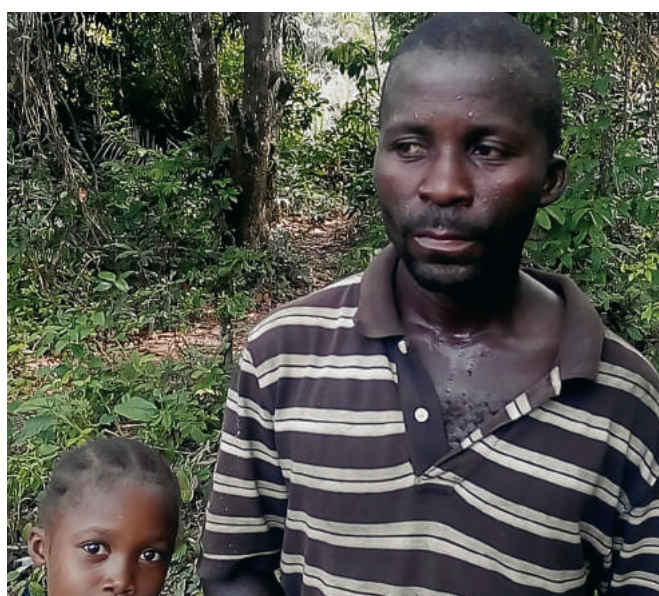
Will he transfer his customary land to his daughter? The action of the Legislature will significantly impact her future.