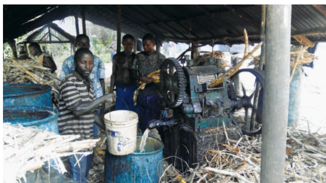
A community sugarcane mill used for processing local alcoholic beverages. Sugarcane farmers report they have tripled their household incomes using their land in the four years they have had the mill.