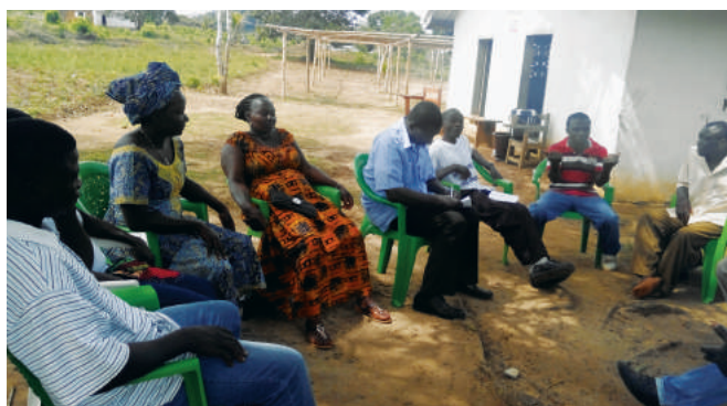
Community Animators in Gbarpolu map threats to their customary land.

The Draft Bill also defines four categories of land ownership in Liberia. They including Public Land, Government Land, Customary Land and Private Land. Until this bill is passed into law, all lands in Liberia are either classified as private or public land. However, the government has placed a moratorium on the sale of all public land.