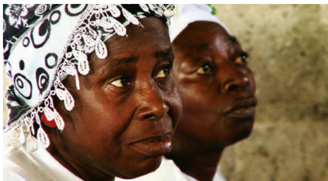
Women participants at a community forum in Bong Mines.

Common concerns among youths and women about the distortion of information from land management bodies related to transactions with external actors for commercial purposes.