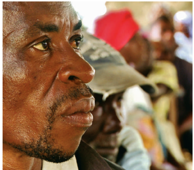
Local people are holding their breath and hoping that the Liberian government will recognize their rights to their customary land.

The Constitutional Provisions mentioned above as well as the provisions cited in the draft LRA set the legal framework for communities to receive compensation in an event wherein the state acquisition communal land. The compensation must be just and reflective of fair market value of the land in question. In providing compensation for any land in question, that parcel of land must be condemned. 21 There must be a clear description of the land sought to be expropriated and the purpose for which the land sought will be used. In property law and backed by the Liberian Constitution referenced above, the use must be for the public interest.